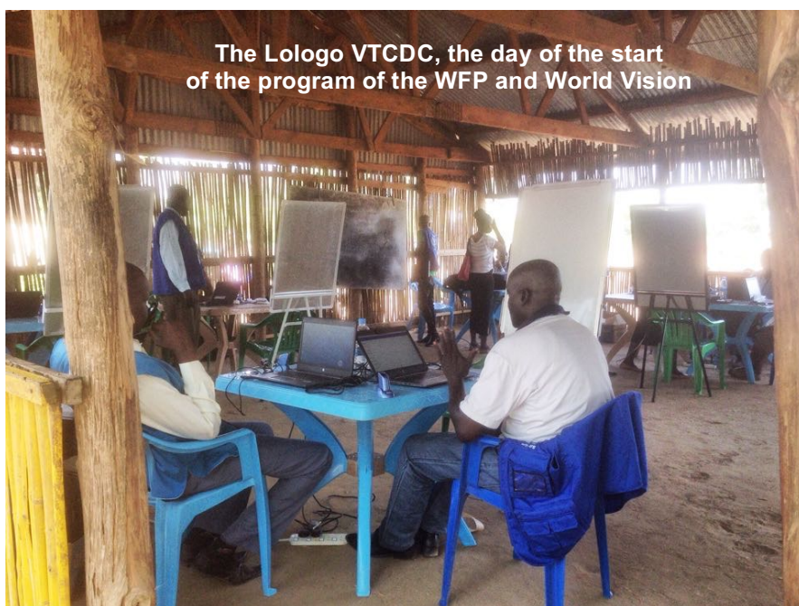
The Lologo VT CDC, the day of the start of the program of the WFP and World Vision

"When their operation is over," says Betram, "we will discuss with the organizers to see how they can help the VT CDC."