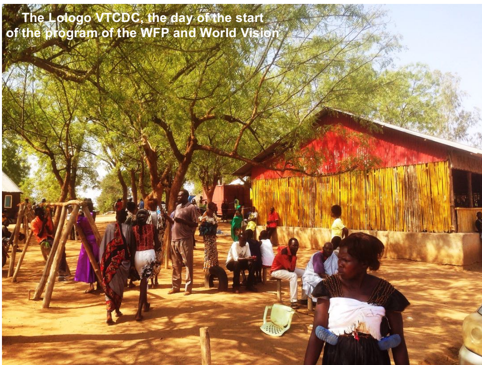
The Lologo VT CDC, the day of the start of the program of the WFP and World Vision

On the day of our appointment, all the Swiss were... in Switzerland. We met two South Sudanese employees.